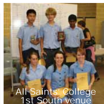
All Saints' College 1st South venue