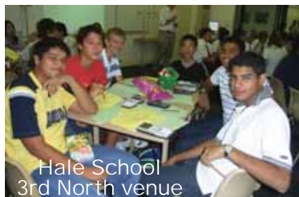
Hale School 3rd North venue

Special congratulations to Christ Church Grammar School's team on winning The Larry Blakers Award for the top team in the Upper HSF competition in 2008. A total of 64 teams of six students competed. Congratulations to all the winners and many thanks to all the teams and their dedicated teachers for supporting the competition. Last but not least, the HELPERS without whom the competition couldn't take place.