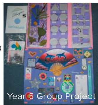
Year 5 Group Project