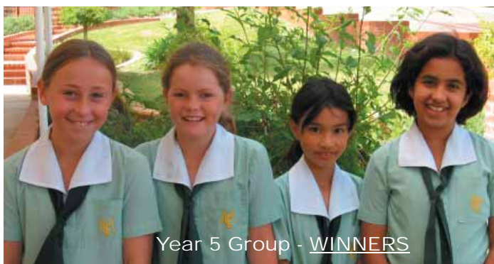
Year 5 Group - WINNERS

Lucky WINNER of one year's MAWA membership